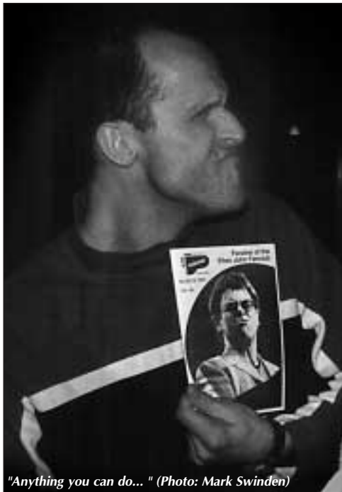
"Anything you can do..."

"He'll be enjoying a nice cool drink, while his fax machine blows up, his air conditioning unit goes to town, while his cellular phone ceases to work, and the gas, water and electricity stop working, failing to chill his drinks because the local company provider hasn't got its system Y2K compatible. So I'm not sure about that!"