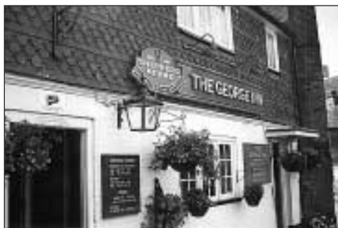
The George Inn - spot the Hercules logo!