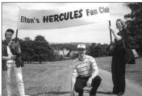
Leeds Castle - where are you EJ??