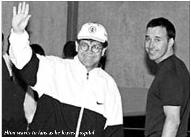
Elton waves to fans as he leaves hospital

See page 25 for more information on Elton's pacemaker