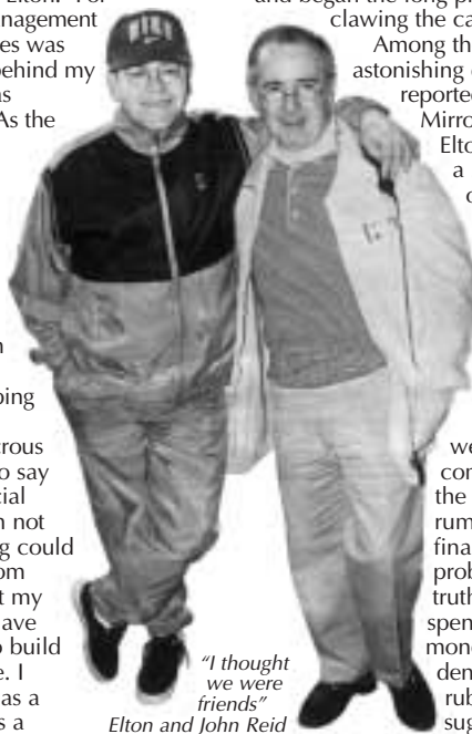
"I thought we were friends"

And Elton went on to comment about the recent rumours of his financial problems; "The truth is, I do spend a lot of money. I don't deny that. It's rubbish to suggest that I