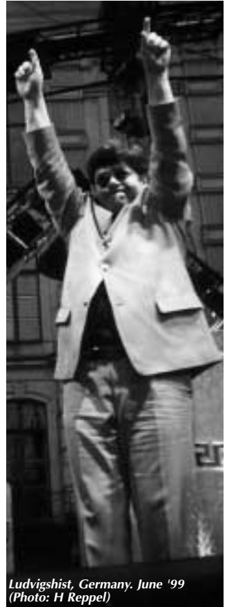
Ludwigshist, Germany, June '99