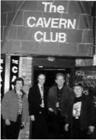
Ready to go in...